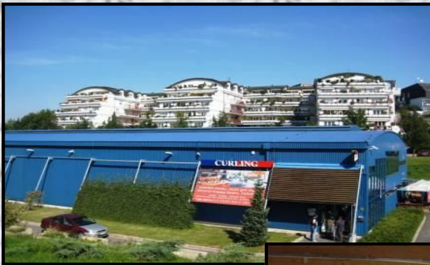
THE ICE RINK