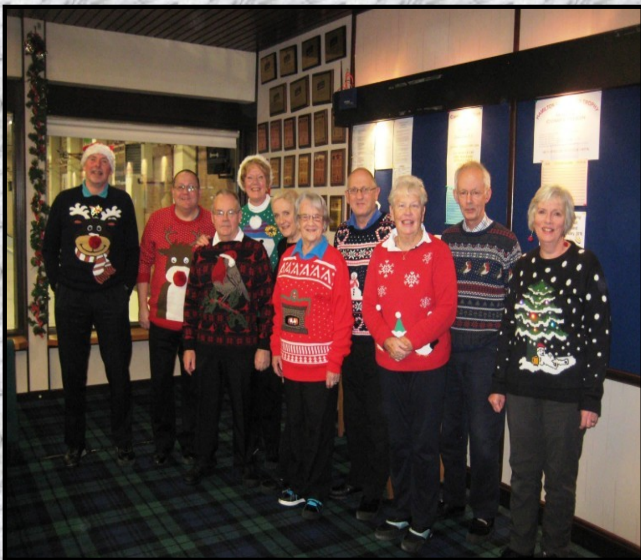
MEMBERS OF LANARK CC SPORTING THEIR CHRISTMAS SWEATERS