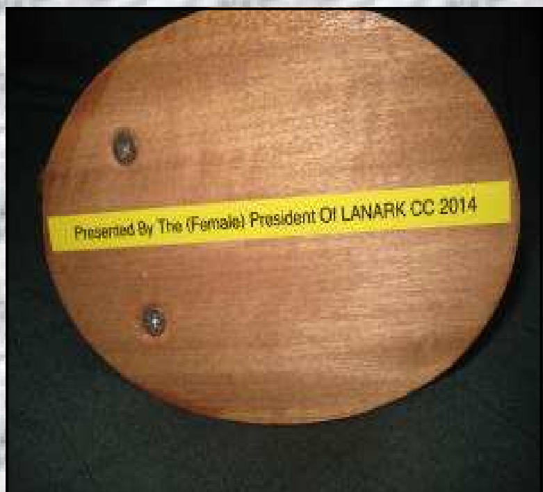
The base of the trophy