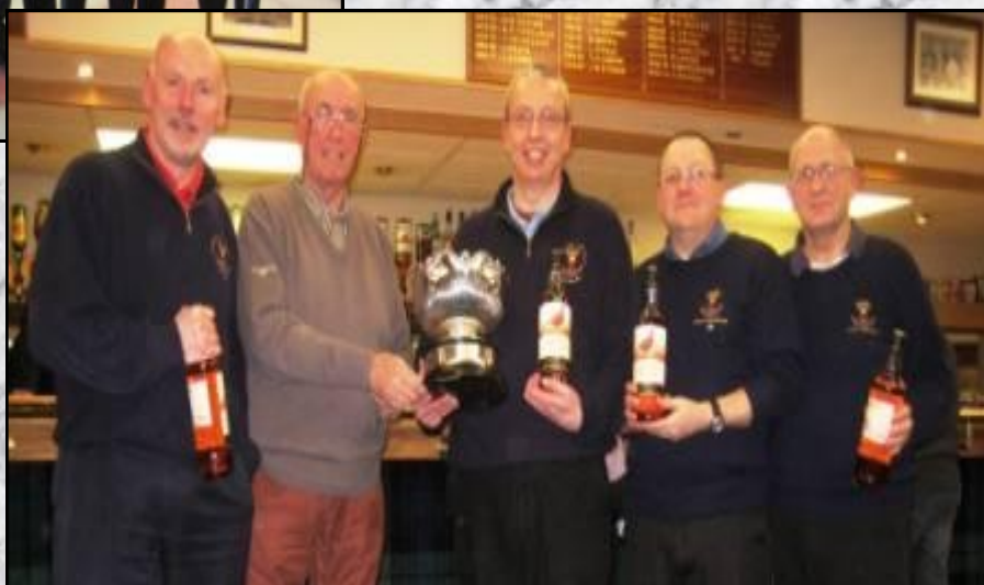
Galloway Cup Victors