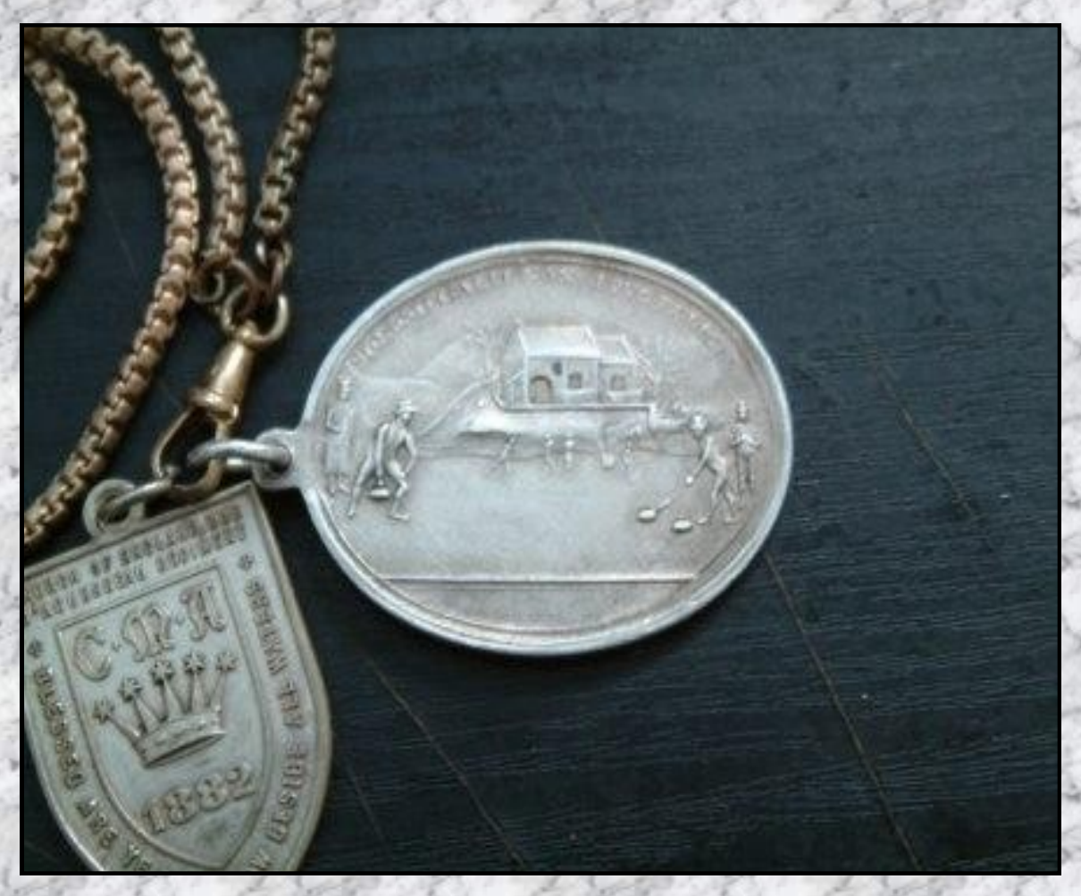
The motto "SIC SCOTI; ALII NON AEQUE FELICES" roughly translates from Latin as "this is the way the Scots play: the rest of mankind isn't equally lucky"