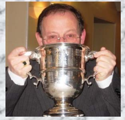
And what a season that was......