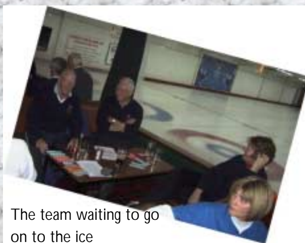
The team waiting to go on to the ice