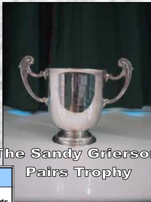
The Sandy Grierson Pairs Trophy