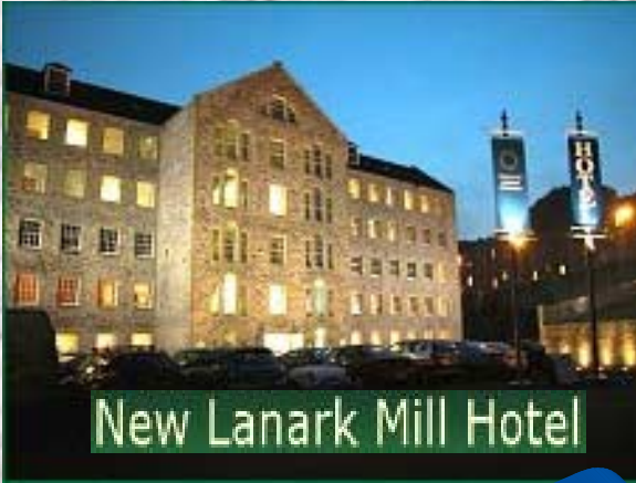
New Lanark Mill Hotel