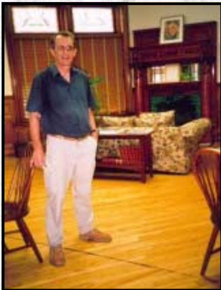
Left Foot Canada, Right Foot USA Derby Line VT