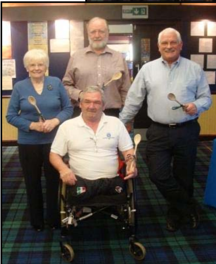
THE WOODEN SPOONERS!