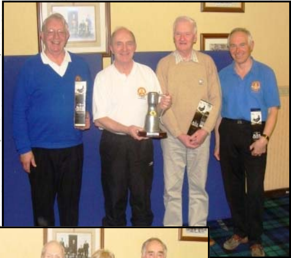
THE WINNERS (Congratulations)