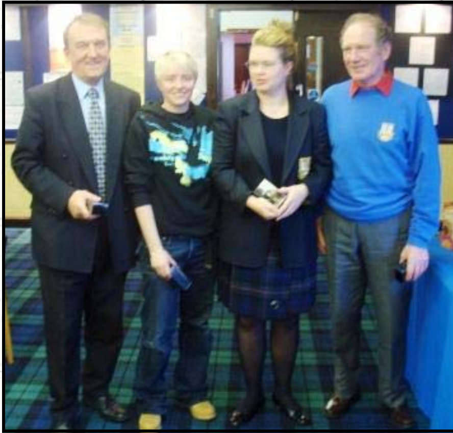
THE RUNNERS- UP