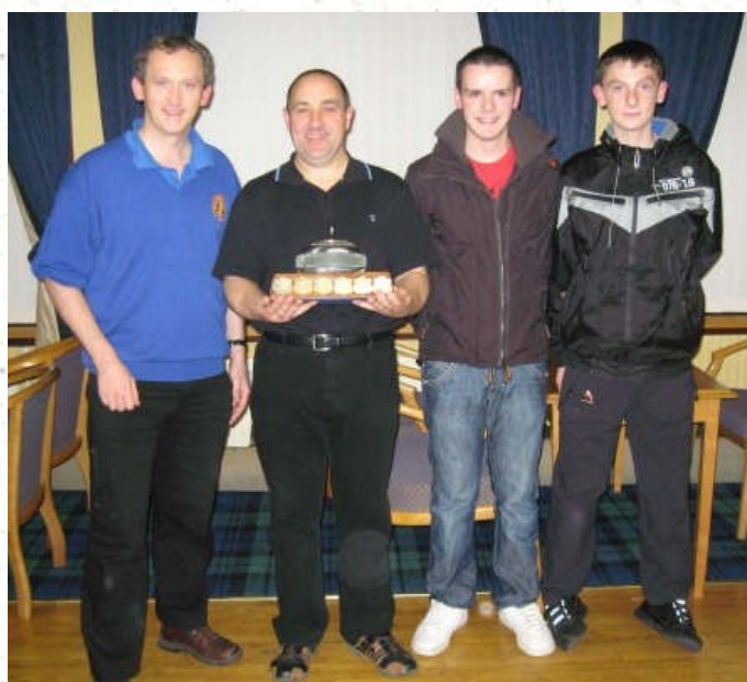
Winners - 2008